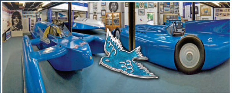
Donald Campbell CBE

Our tribute to the racing Campbells, Sir Malcolm and son Donald, who between them captured 21 world land and water speed records for Great Britain, in the Bluebird series of cars and boats.